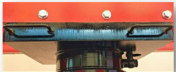
Detail of the handles for moving the cylinder